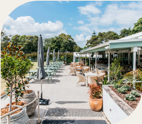
THE VERANDAH BEECROFT