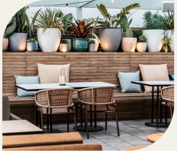
THE ALCOTT LANE COVE