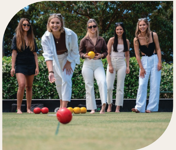
THE GREENS NORTH SYDNEY